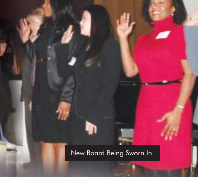
New Board Being Sworn In